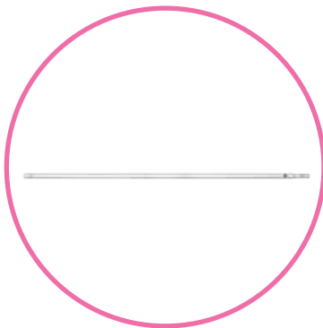
QTY 8: Horizontal Tubes

Outside Dimensions: • 66" L x 14" W x 7 1/2" H Inside Dimensions: • 65 1/2" L x 14" W x 7 1/2" H