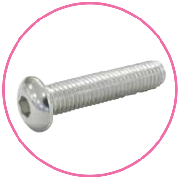
QTY 20: Large Screws