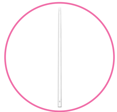
QTY 6: Vertical Straight Tubes