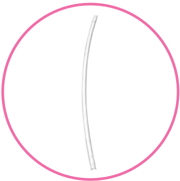
QTY 4: Vertical Curve Tubes