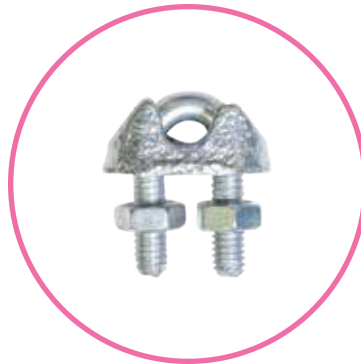
QTY 10: Hook Loop Lock