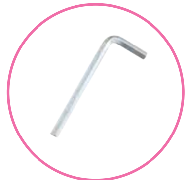
QTY 1: 6mm Allen Key