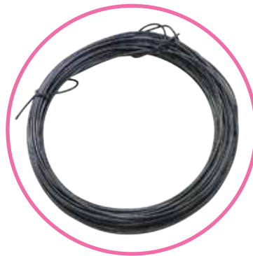
QTY 1: Cable