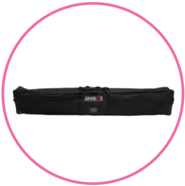
QTY 1: Carry Bag

Outside Dimensions: • 66" L x 14" W x 7 1/2" H Inside Dimensions: • 65 1/2" L x 14" W x 7 1/2" H