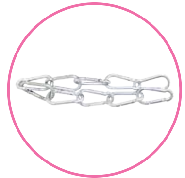
QTY 10: Chains