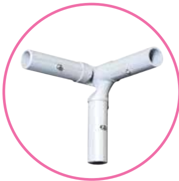
QTY 8: Corner Connectors