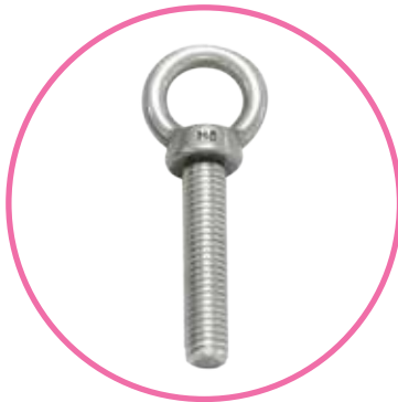
QTY 4: Eyehook Screws