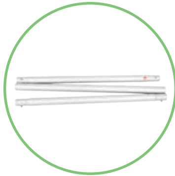
QTY 1: Bottom Horizontal Tube Set