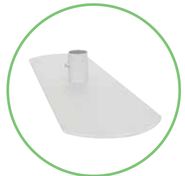
QTY 2: Feet