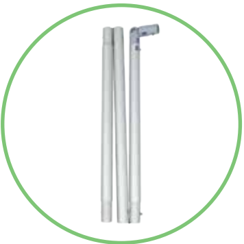
QTY 2: Vertical Tube Sets