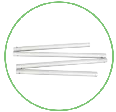
QTY 1: Top Horizontal Tube Set