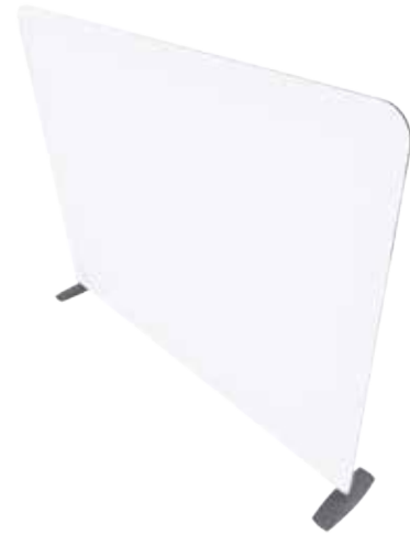
Single-Sided Back View